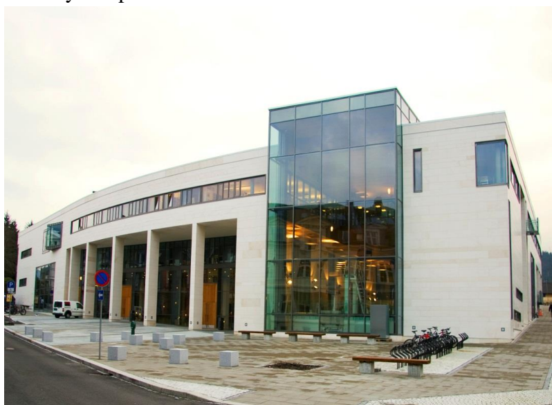
Studentsentret in Bergen, Parkveien 1 (conference venue)

The lectures and the poster sessions take place at “Studentsentret” on Parkveien 1. It is a large white building with a swimming pool in the ground floor. As seen from the city centre it sits on a hill with the Johanneskirken (red cathedral building) and the Natural History Museum and the main University campus.